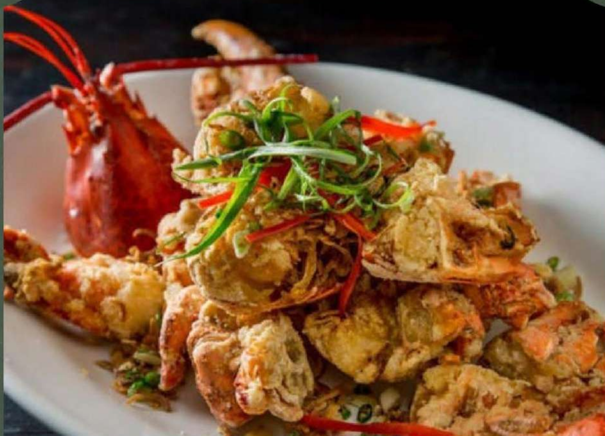
Vietnamese style Salt and Pepper Lobster with crispy egg noodles