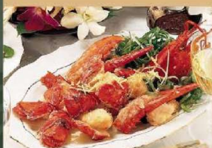
Lobster stir fry with egg noodles

Choice of ,ginger shallot sauce or XO sauce $90