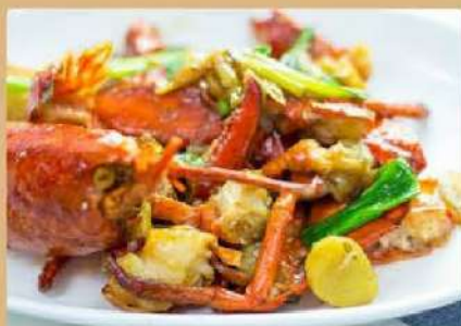
XO Lobster with egg noodles

Choice of ,ginger shallot sauce or XO sauce $90