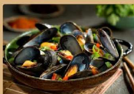
Stir fry mussels